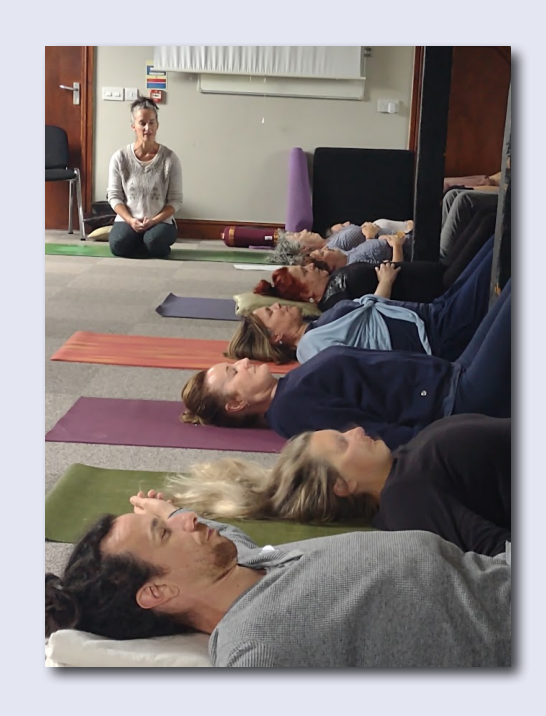
Yoga Teachers at our 2023 BWY-Approved Training Module