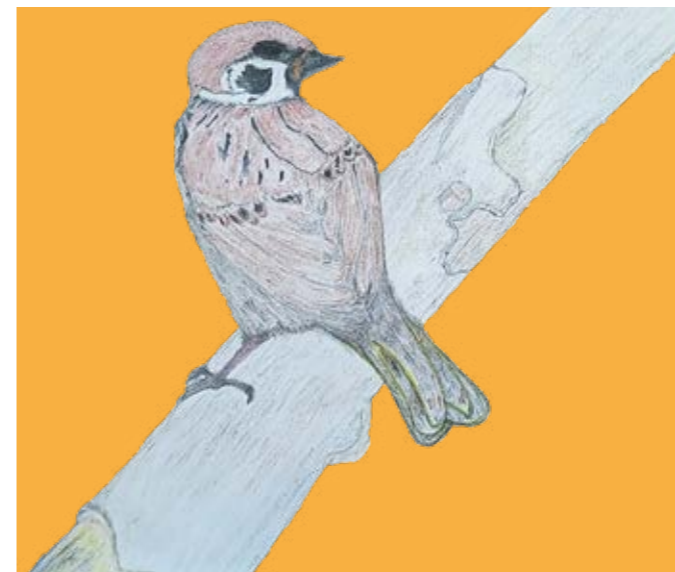
Artwork from HMP Hull

Do not worry if you find it difficult, there are many different meditations. Just try and try again.