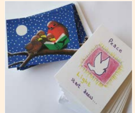
2025 Designs from HMP Whatton and HMP Haverigg